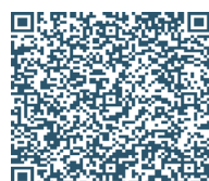
QR-Code – scan contact details

Tel.: +49 69 24 44 88 10, Fax: +49 69 2 44 48 81 99 E-Mail: gerhard.jovy@acarda.de , www.acarda.de